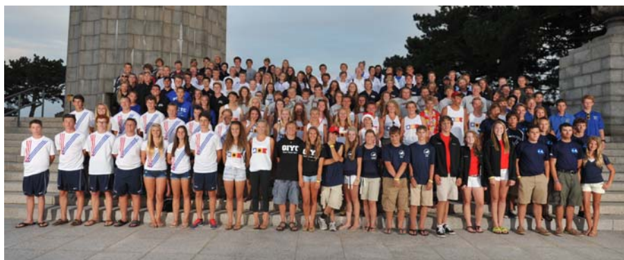
Competitors, coaches and volunteers