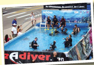
NEW! Be a Diver Pool - Scuba Dive for FREE!