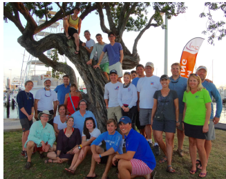
Orange Bowl: Lots of smiling faces! Great sailing. Solid finishes. And, most importantly, families from numerous clubs and four different states getting together in Miami and having a great time.