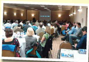
Lake Erie University (boating seminars)