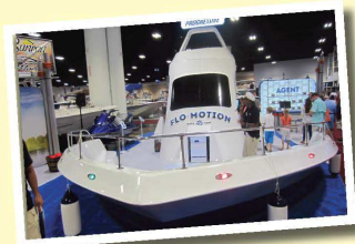
Stop by the Progressive® Insurance Welcome Harbor