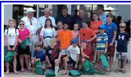
A host of Opti winners at NCYC

Our Junior Race Team has been very active this first half of the season with five regattas under their belts, including Buckeye Lake, Hoover, Edgewater, Sandusky and North Cape. It has been quite an experience loading up our tow caravans of up to 11 Optis, two Lasers, and three 420's, not to mention the coach boats.