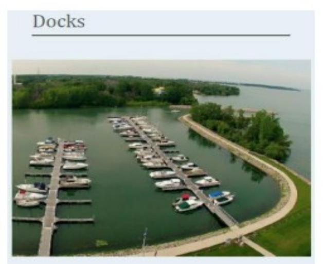
Middle Bass Island Yacht Club currently has 56 docks within the Middle Bass Island Marina. Extra wide slips, dual 30A service, and fresh water ensure an enjoyable stay.

With first class dockage, a comfortable club house, large deck, clean restrooms, a grilling pavilion and restaurants/attractions nearby, we hope you consider an outing to our island destination this season!