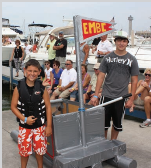
Participants in the 2011 Cardboard Boat Race