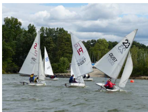
Ohio High School Sailing Regatta at HSC