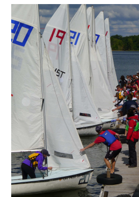
OSU Buckeye Invitational Regatta on Hoover Reservoir in Westerville

Kudos to The Ohio State University, University of Toledo, Grand Valley State University, Miami University and Hope College sailing teams for top finishes.