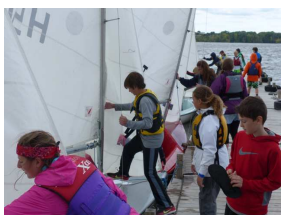
Ready to launch Ohio High School Sailing Regatta at HSC