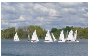
OSU 2015 Buckeye Invitational Regatta at HSC

The Ohio State University's fall Buckeye Invitational was held on September 19 th and 20 th at Hoover Sailing Club. Lots of wind and competition! Fourteen teams representing eleven universities, including The Ohio State University, University of Toledo, Indiana University, Wittenberg University, Michigan State University, Miami University, Grand Valley State University, Ohio University, Hope College, Denison University and Michigan Technological University competed at this event.