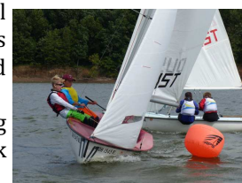
On the water at Ohio High School Sailing Regatta at HSC