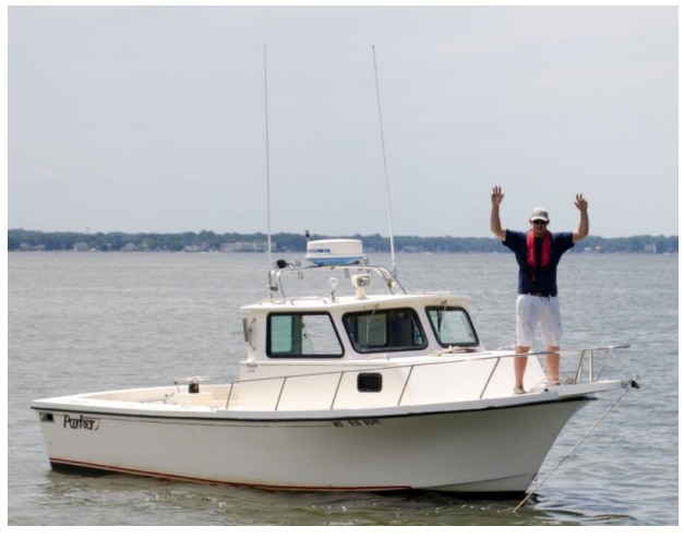
Are you making it harder for rescuers to find you in an emergency?

Register your EPIRB or PLB : The U.S. Coast Guard receives hundreds of false alerts each year from these critical safety devices. To free up more time for responding to real emergencies, boaters need to properly <u>register their</u> <u>Emergency Position Indicating Rescue Beacon (EPIRB) or</u> <u>Personal Locator Beacon (PLB)</u>. If you need a beacon for only a short period of time, rent one from the affordable <u>BoatUS Foundation EPIRB/PLB rental program</u>.