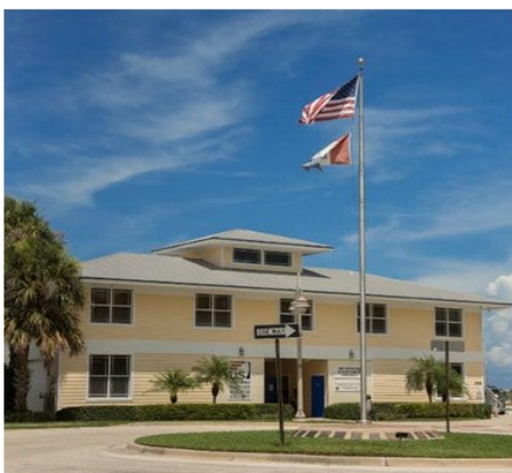
US Sailing Center Martin County in Jensen Beach, Florida