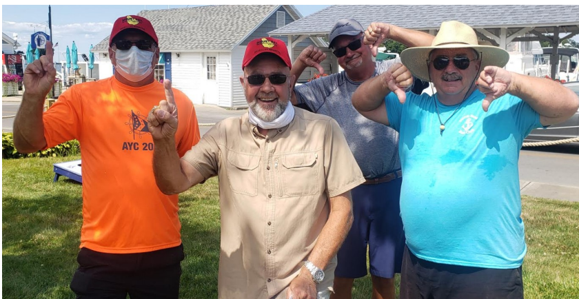
East against West in the 2020 Corn Hole Tournament.

WITH SO MUCH FUN, HOW CAN ANYONE NOT WANT TO JOIN US AT THE BAY FOR THIS YEARS POWERBOAT REGATTA